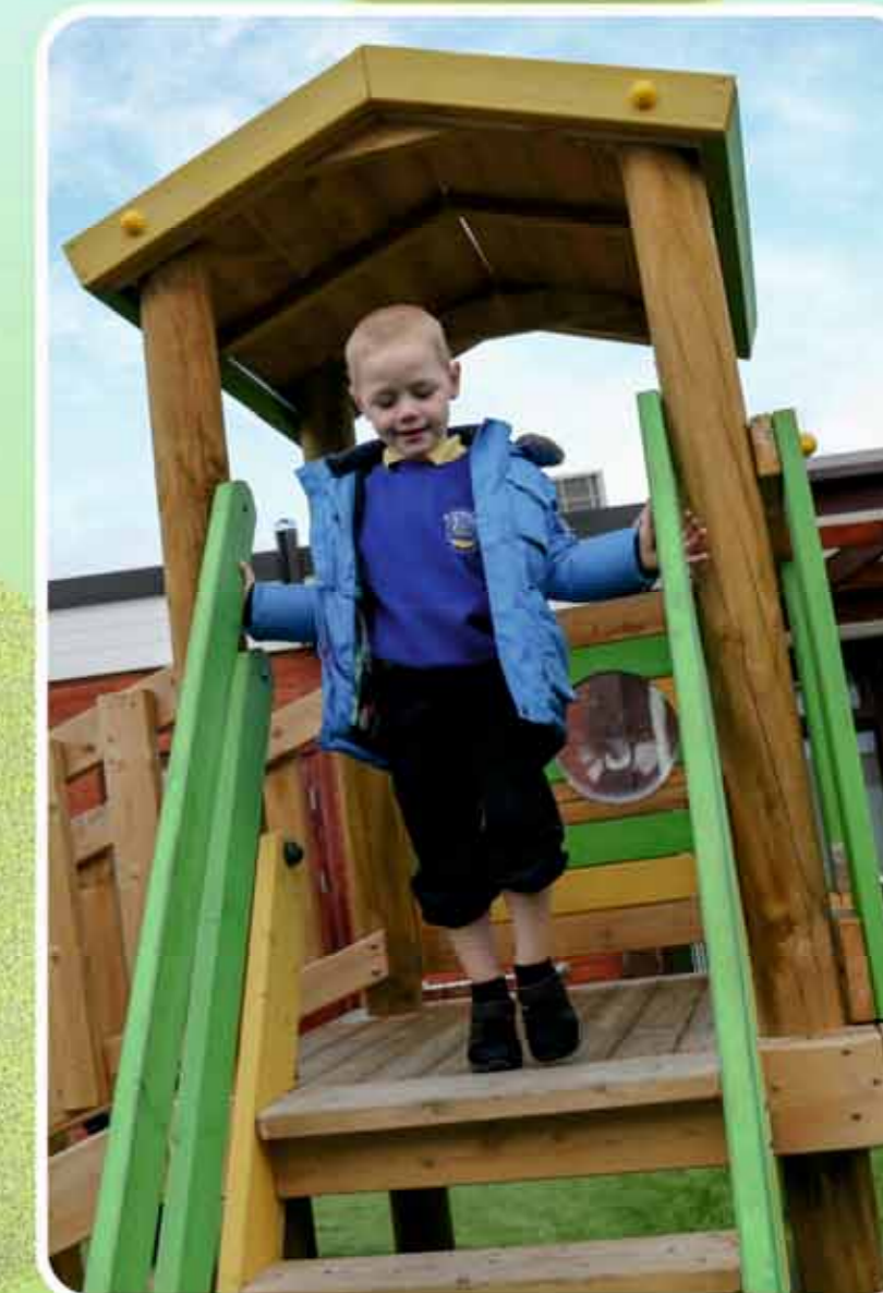
EXAMPLES OF YOUNG EXPLORERS

Drawing No: NMQ4413_B Drawn By: DO 4 Scale: 1:200 @ A2 Date: 30-07-19 Page: 1 of 1