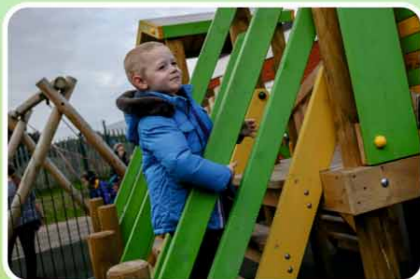
EXAMPLES OF YOUNG EXPLORERS