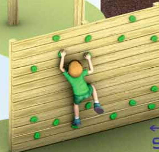
3D EXAMPLE OF A SINGLE SIDED BOULDERING WALL